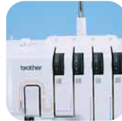
4 colour easy threading guide