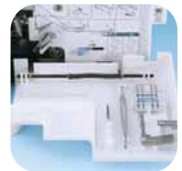
Built-in accessory storage