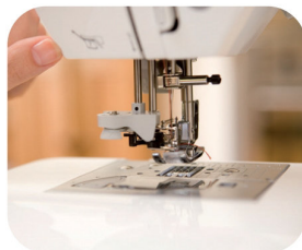
Easy automatic needle threading.