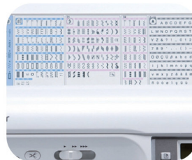
Quick reference panel to easily see all 294 stitches.