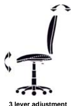
3 lever adjustment