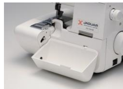
ATTACHABLE LINT TRAY