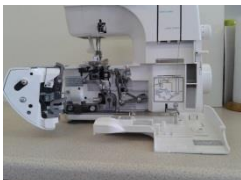
EASY ACCESS THREADING