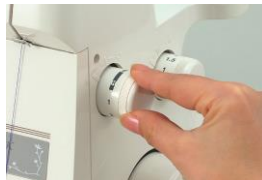
BUILT IN ROLLED HEM